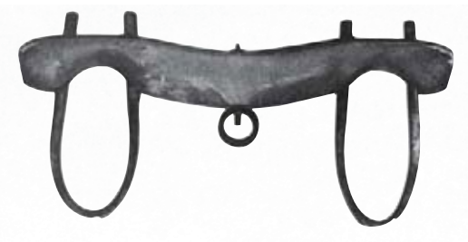
Ox Yoke—used on teams of oxen pulling emigrant wagons—forced the team to pull together equally. Circa 1840s.

ver time, the myth of the "Great American Desert"that vast sea of grass-has faded into obscurity. The first leg of a transcontinental journey, last to be settled, is now part of America's heartland. Many traces of the old Kansas/Missouri gateway to the American West are still visible. Some traces are commemorated with parks, monuments, museums, and visitor centers; others are only highway pullouts near isolated grave markers, wagon swales through creek beds, and scatters of adobe and melted glass where a mail station once stood. In some places, today's traveler can see protected patches of original tallgrass prairie, sites of native villages, and landmarks, mounds, and springs that marked the slow progress of travelers 150 years ago. Historic trails, recognized by Congress under the National Trails System Act, identify the prominent past routes of migration, trade, communication, and military action. What remains today are primarily remnant sites and trail segments of these onceprominent roads to the West.