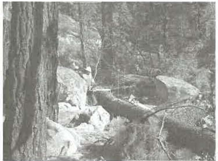
With OCTA permission, power company workers had to drop this tree between the two rocks that define the Trail. They did it perfectly with no damage to the trail and all debris was removed or chipped.