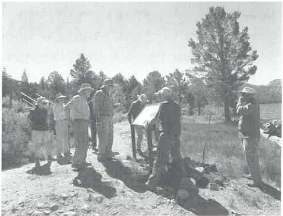
OCTA members installed seven interpretive signs in the Carson Pass and Hope Valley area this year, concluding a multi-year effort to better mark and interpret the area.

Next spring when the replacement of those old power poles is scheduled likely there will be a renewed need for OCTA members to monitor that work.