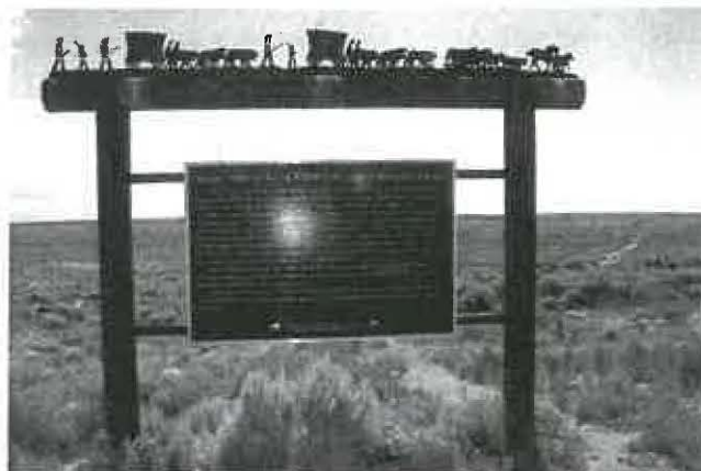
The Lander Road, seen to right of sign, is one of the trail areas convention attendees can visit this year during the field trips across southwestern Wyoming.

Thursday and Friday, Aug. 11 and 12, will feature bus tours to Brown's Park, famed outlaw country where the Utah, Colorado and Wyoming borders meet; to South Pass; to the Lander Road and the Sublette