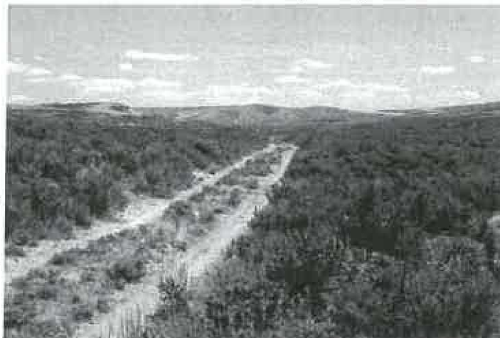
Trail ruts in Carbon County, Wyoming.

This issue carries articles and photos about In Pursuit of a Dream , the documentary film created by Boston Productions for the Oregon-California Trails Association, which was the first major activity intended to attract a younger audience. The film has played at festivals, special venues, and in schools across the country and with distribution to the educational and home markets this spring, it will be even more readily seen.