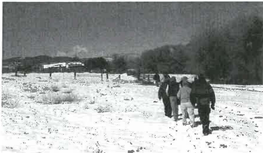
Sometimes a trail experience involves a hike in the snow as these OCTA members found at the Warner Ranch during the Southern Trails Chapter Spring Symposium at Borrego Springs.