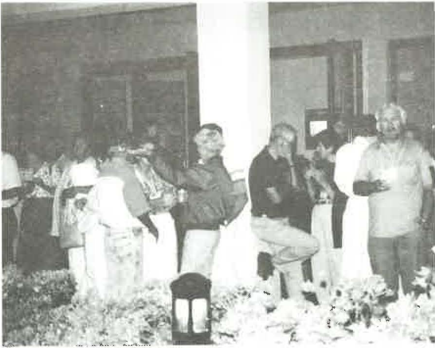
Left: Rainshowers may have dampened the patio area at the Radisson, but it left those attending the reception for convention first-timers undaunted. One person is testing for raindrops as visiting continued under the overhangs.