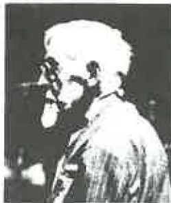
William Henry Jackson (1843-1942)

NOW: All three for $29.95 plus $3.50 P&H