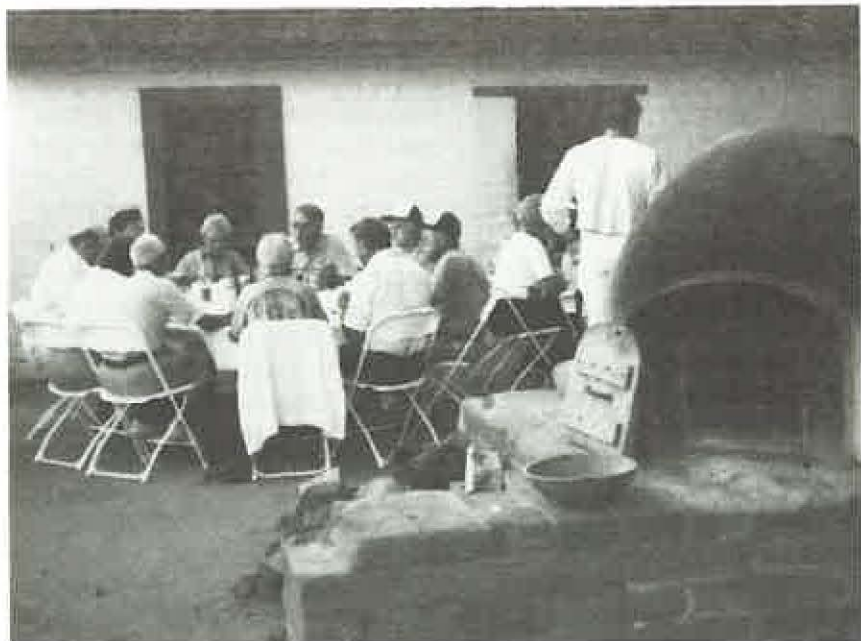
Right: Convention attendees enjoyed an evening at Sutter's Fort where the food was plentiful, the company pleasant and the setting was unique.