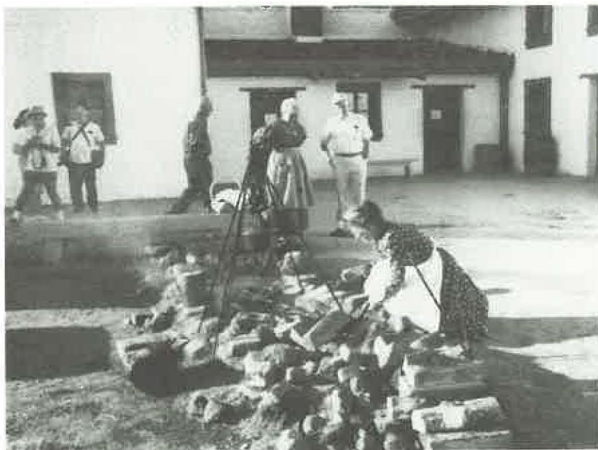
Above: Those who attended the barbecue at Sutter's Fort during the convention enjoyed the numerous living history parts of the evening.

Anyone who has original documents pertaining to the emigrant trails can call (name) at (phone #) ."