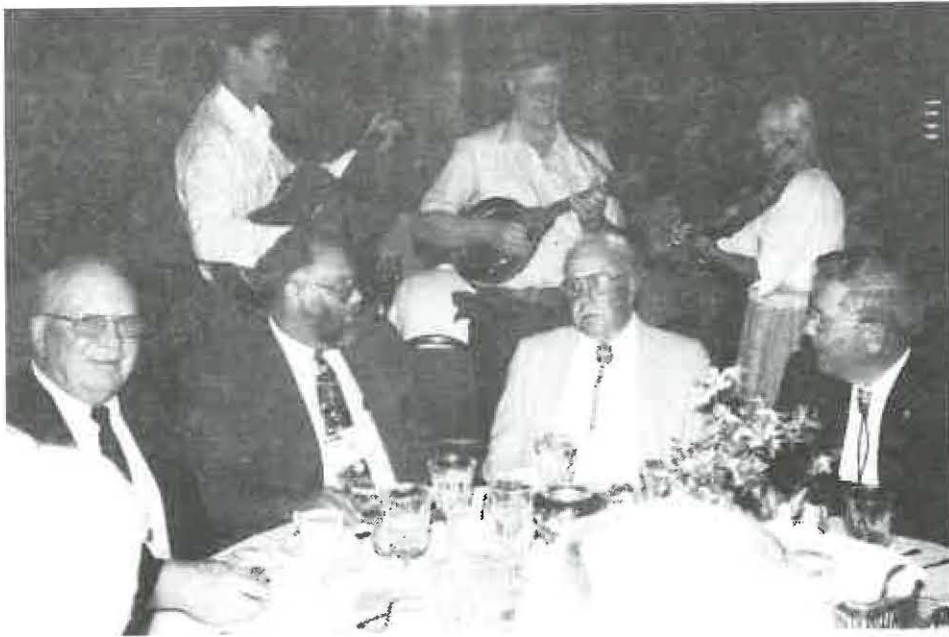
Left: The OCTA JAMMERS entertained the banquet attendees with folk music. Each table received a "seranading".